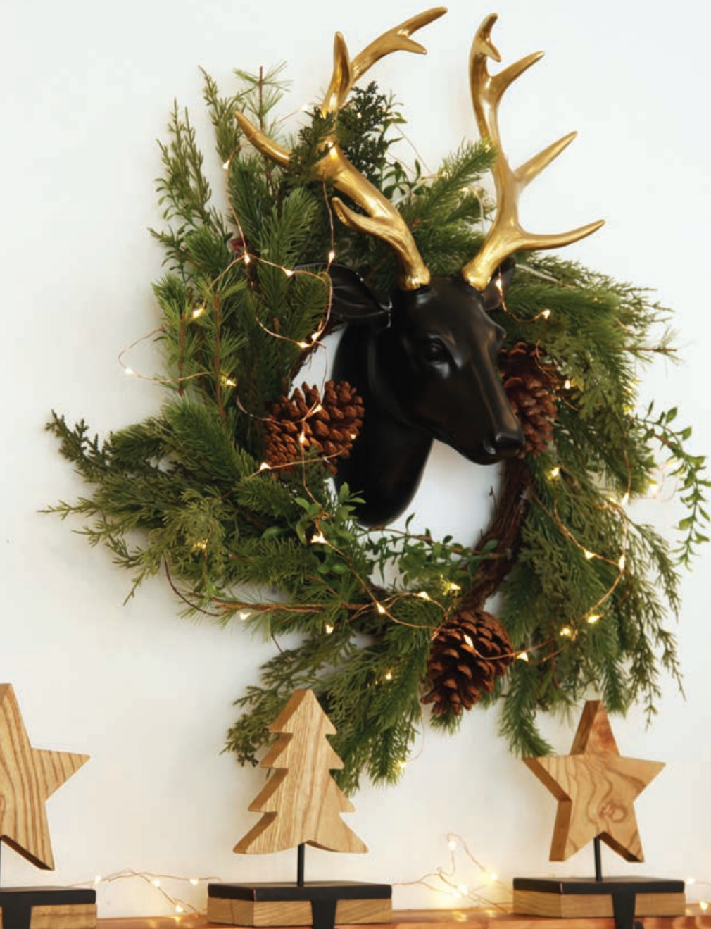
1. BLACK AND GOLD WALL HANGING DEER HEAD, 2. FIR AND PINCONE WREATH. 3. COPPER SEED LIGHTS

FOR A RUSTIC AND FESTIVE FEEL, PLACE A CHRISTMAS WREATH AROUND A DEER'S HEAD AND FINISH OFF WITH COPPER SEED LIGHTS TO ADD A MAGICAL TOUCH.