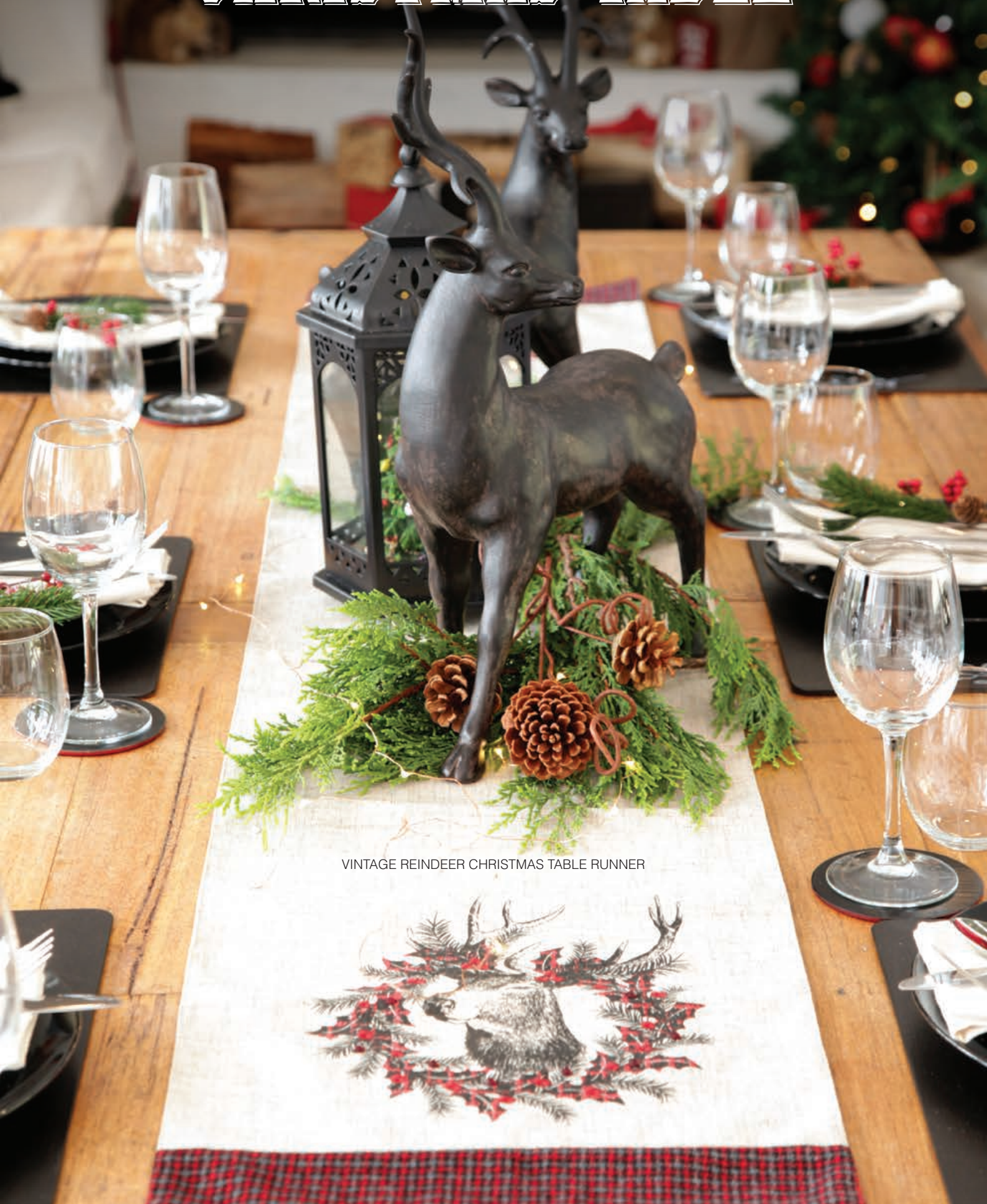
VINTAGE REINDEER CHRISTMAS TABLE RUNNER