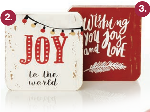
1. SANTA'S TRUCK WITH TURNING TREE LIGHTUP ORNAMENT, 2. JOY TO THE WORLD WOODEN SIGN, 3. WISHING YOU JOY AND LOVE WOODEN SIGN, 4. FIR AND PINECONE SPRAY, 5. SANTA IN RED UTE LIGHT UP ORNAMENT, 6. FIR AND PINECONE GARLAND.