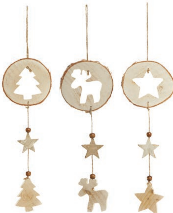
1. WOOD CUTOUT TREE DECORATIONS - SET OF 3, 2. RED TREE, STAR & HEART WOODEN TREE DECORATIONS - SET OF 9 3. RED VINTAGE DEER CHRISTMAS DECORATIONS - SET OF 6, 4. FARMHOUSE TREE DECORATIONS - SET OF 6