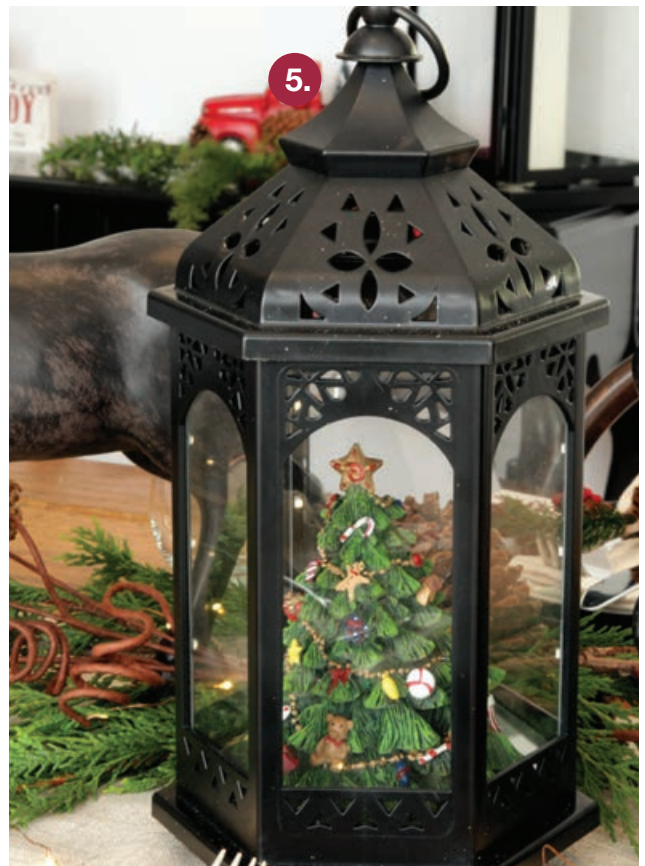
1. RED BERRY AND PINE CONE MIX, 2. PERSONALISED GIFT TAGS SQUARE CUT, 3. MINI RED BERRY AND LEAF CHRISTMAS WREATH, 4. ANTIQUE MATT BLACK BELL TRIO, 5. BLACK LANTERN WITH TREE LIGHT UP ORNAMENT